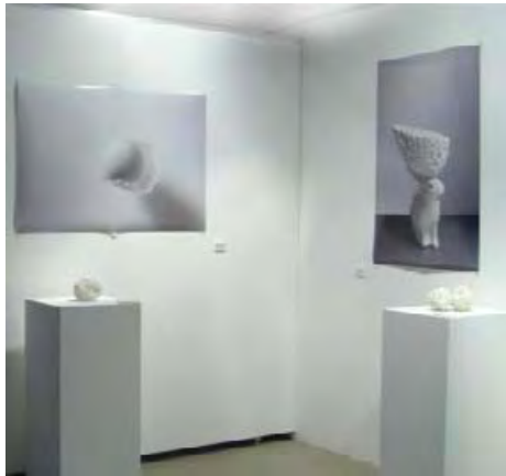
Tintelingen – Netty van den Heuvel

Tintelingen ( twinkling ), August's exhibition of work by Dutch artist Netty van den Heuvel, might have been small with just five ceramic exhibits and three photographic images but it certainly stood out as far from the ordinary.